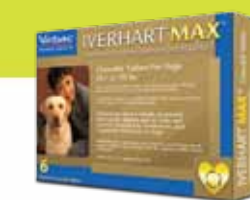
Available in 4 tablet sizes