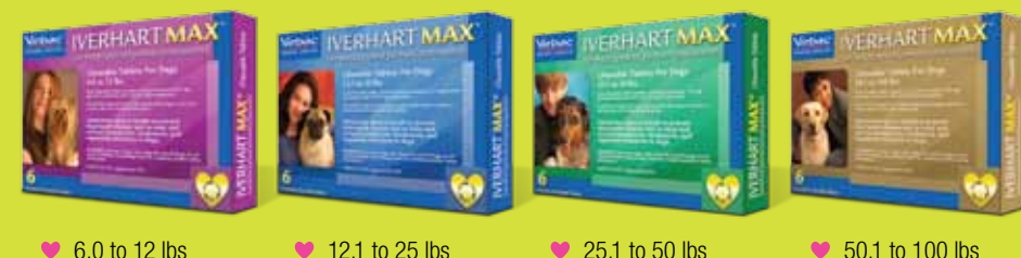
IVERHART MAX Chewable Tablets are available in 4 tablet sizes